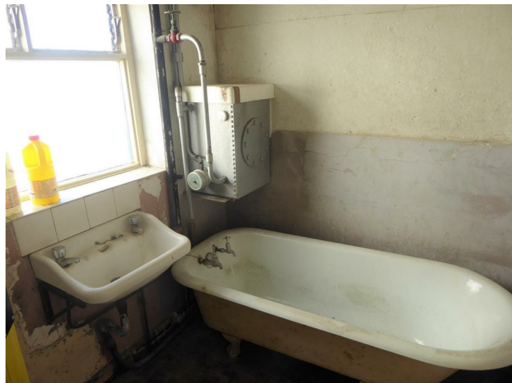
Wash hand basin, high level w.c, freestanding bath.