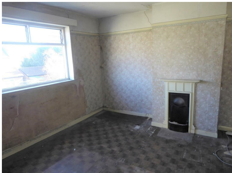
Rear aspect window, feature fireplace.