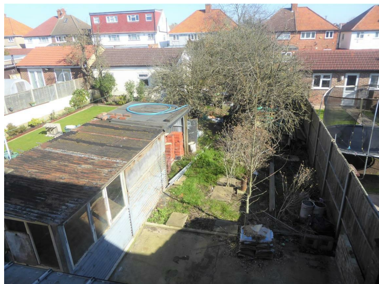
Concrete area, rest laid to lawn, storage shed.